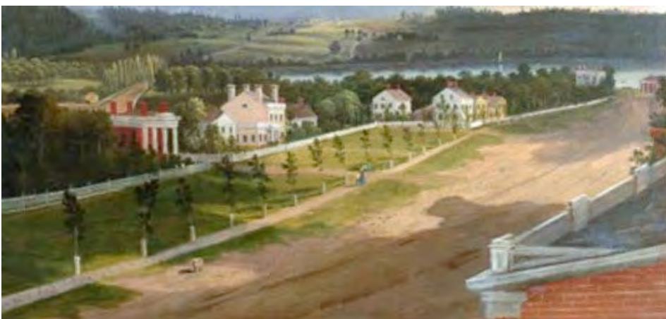
Painting looking west over the Public Square with Century House (red) before alterations, newly planted trees on the Public Square and John Lincklaen's land office in the distance by the lake.