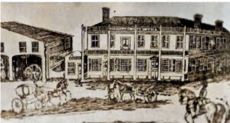
Madison County Hotel, to east of Century House and former Smith's Funeral Home. Several sections remain in the village.