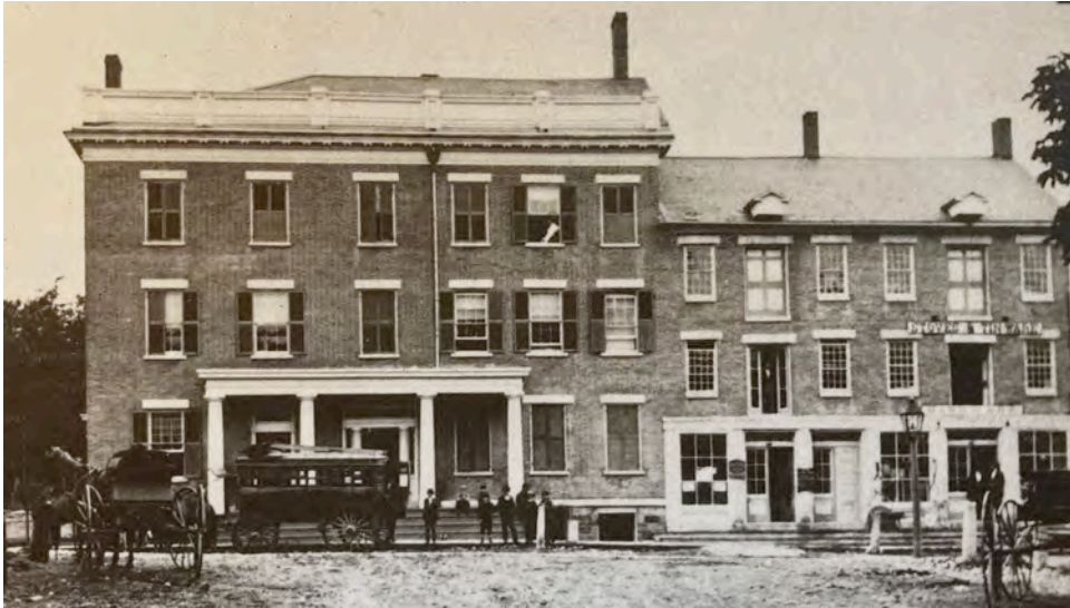
Lincklaen House and Commercial buildings, mid- 19 th century