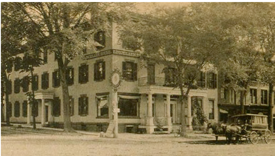
Lincklaen House around turn of the century with large bar room windows added.