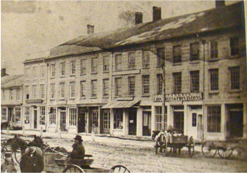
South side of Albany Street with five stone buildings and early 19 th century Federal style commercial building to left. C 1860s.