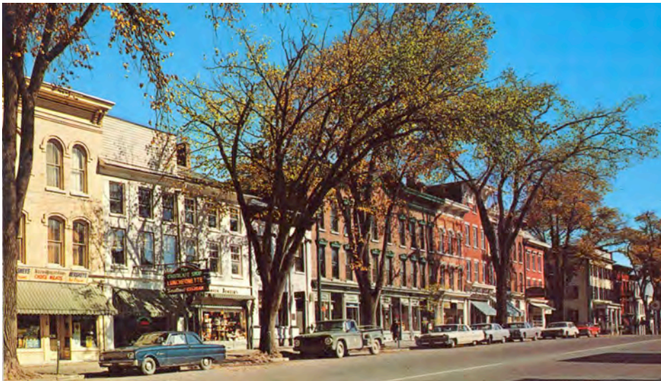
Similar view 1960s.