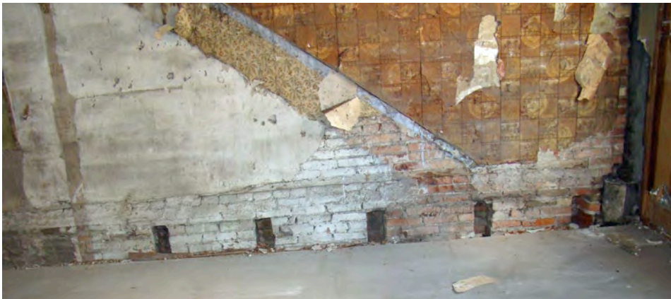
Interior former Albert's building first story showing original height of first story floors about 14" higher than they are now; typical for entire street.