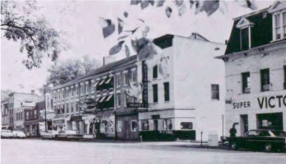
Left: Same view 1960s after removal of Park House porches and tower and conversion into a Victory Food Market.