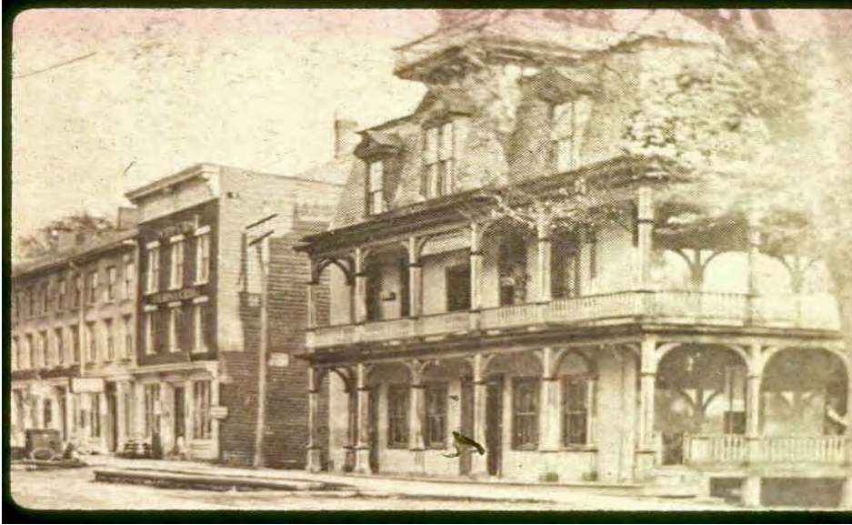
South side of Albany Street with Park House to right and other commercial buildings c. 1900.