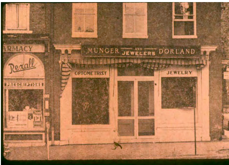
Later details of same building.