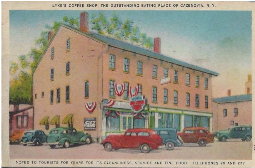
1840s McLaughlin Building 1930s.