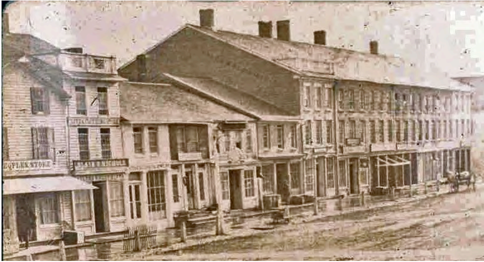
South side of Albany Street looking west before fires, Loka Leaf is building on left. Note five stone buildings and flanking Federal style commercial buildings.