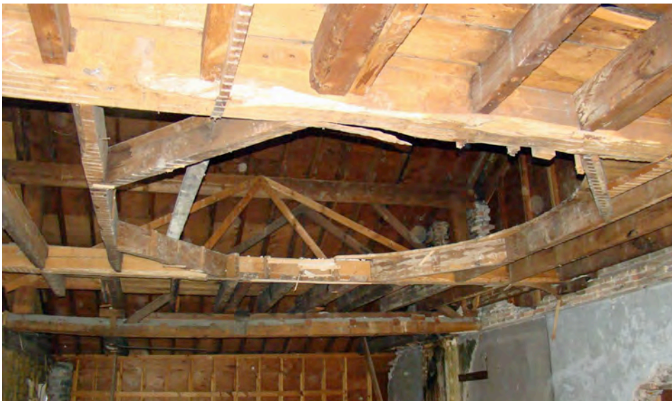
Interior former Albert's building, now Allure Dance Studio, third story framing for public hall space with circular opening to skylight and cupola.