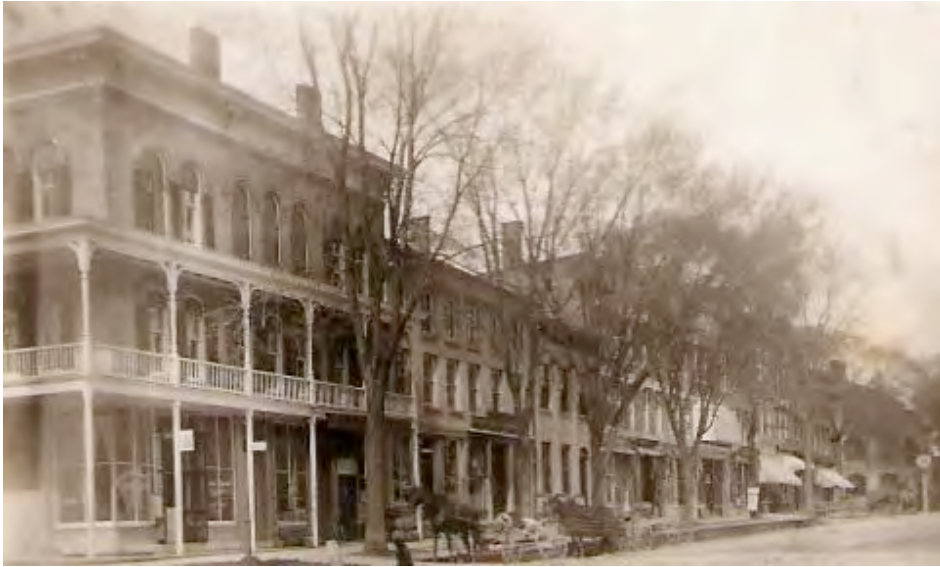
North side of Albany Street looking east early 20 th century.