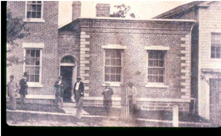
Counting House, one story