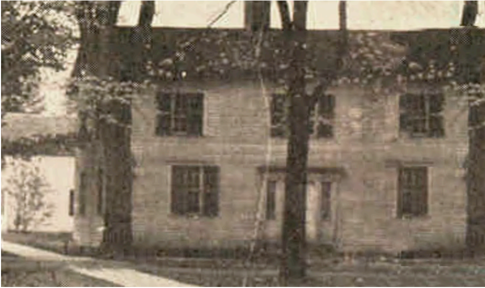
Poor image of pre-1807 Breen House where J. Lincklaen boarded after the 1807 fire.