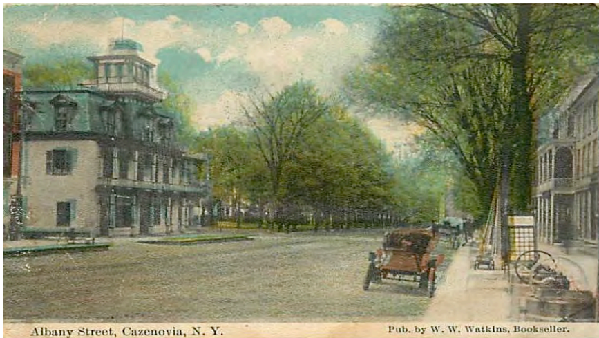
Looking west towards Public Square with Park House on left.