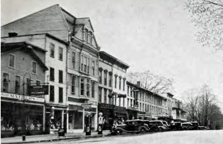
Same as above showing scale of buildings.