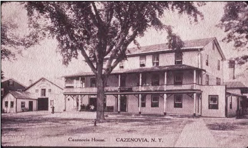
1820s Cazenovia House hotel where Kinneys is today, demolished in the 1960s for a super market. Note garage to left.