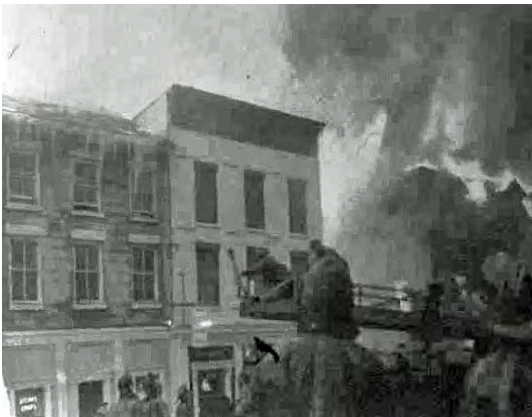
Lower Right: After fire and first Oneida Bank one-story infill building with truncated Alberts, left, after fire. 1970s