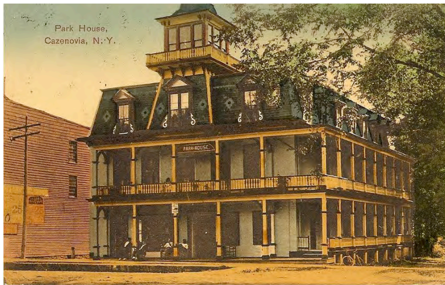
Park House as updated in 1880s with porches and tower simply attached to 1830s hotel building.