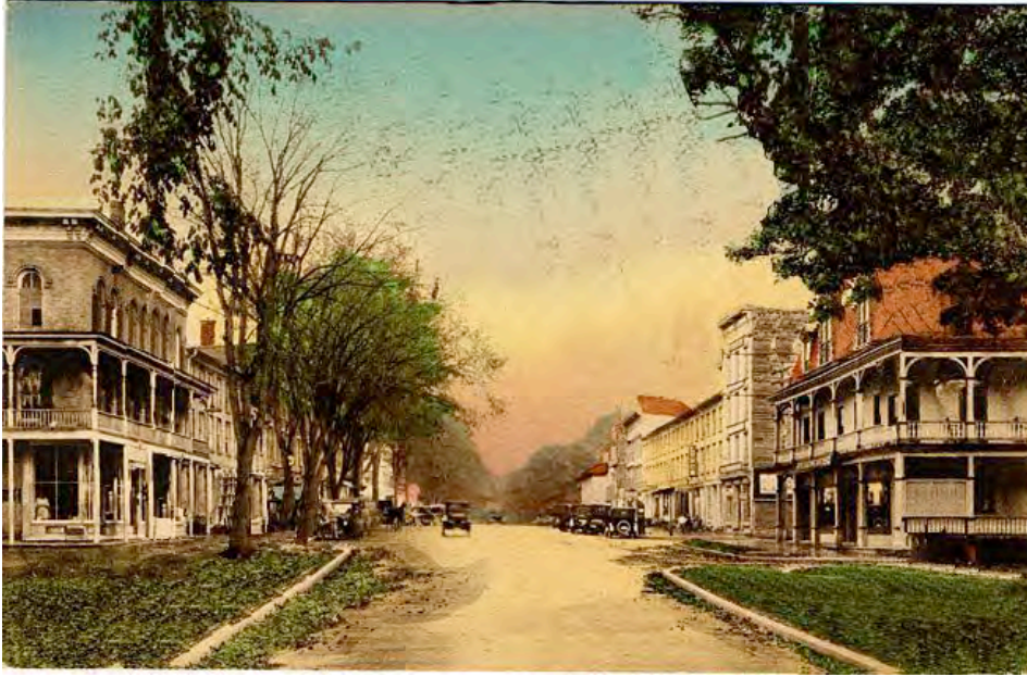
Public Square looking east showing narrower street and general appearance around 1920.