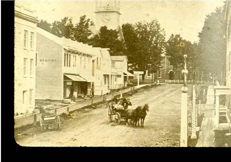
Lincklaen Street early 19 th century frame commercial buildings