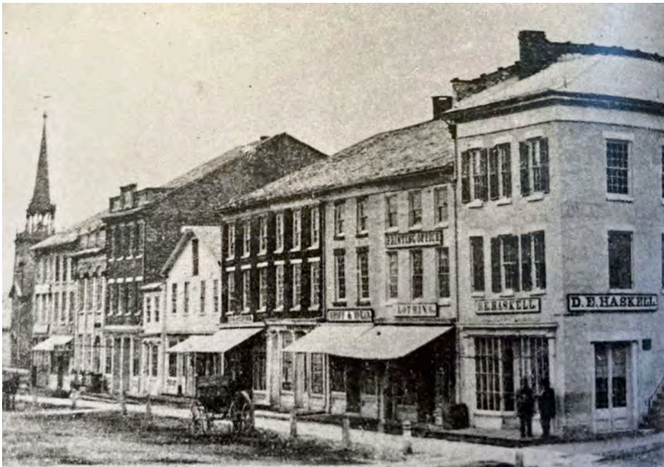
Left: 1860s north side of Albany Street before fires with stone and masonry front commercial buildings. Note Presbyterian Church with gray colors.