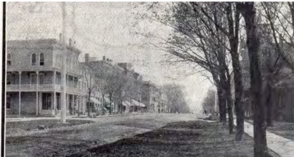
Similar view as above showing Public Square with plantings and Masonic Lodge building with porches.