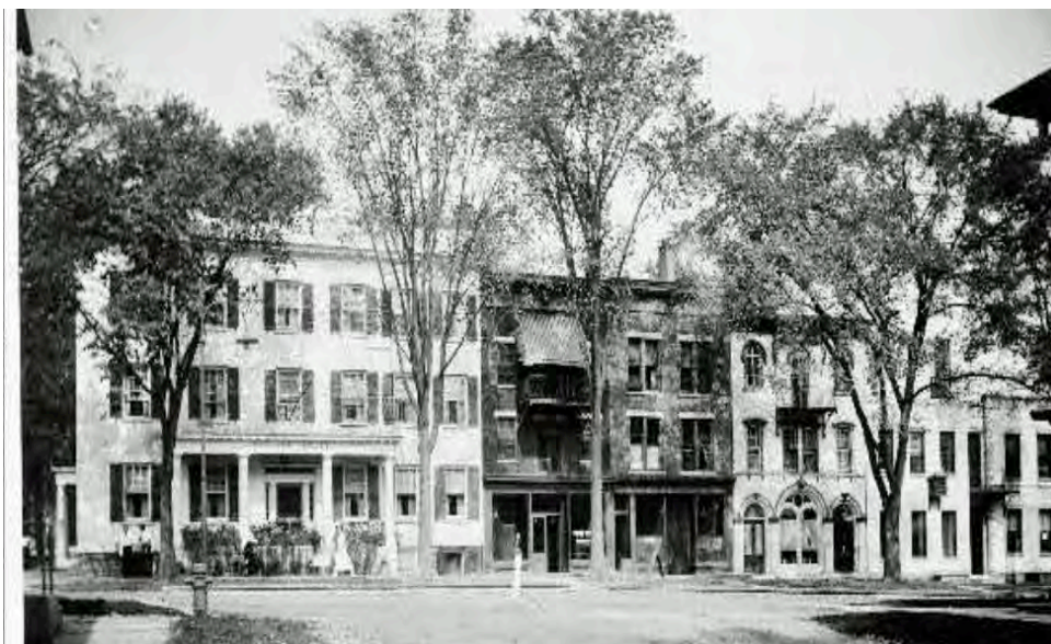
Lincklaen House and commercial buildings 1920s reflecting late 19 th century changes