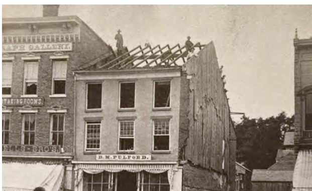
Below: After fires, left shows detail of masonry building being repaired, right half of building was lost in fire. Right shows north side after fires and Mansard roof on corner building and new infill buildings.