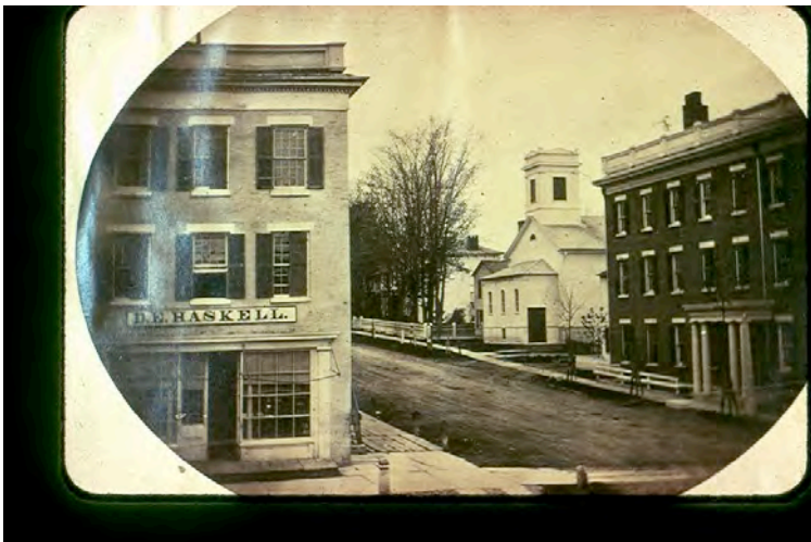
Lincklaen Street note details on brick building to left.