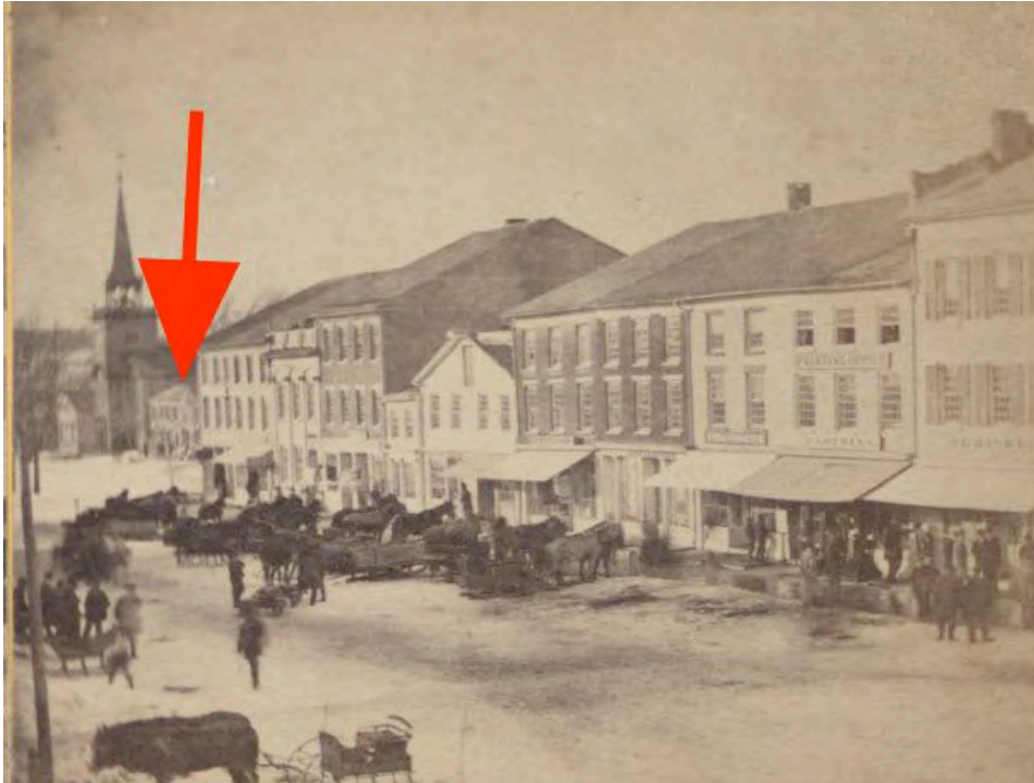
c. 1860s, north side showing early 19 th century frame commercial buildings and Eddy Block on Public Square