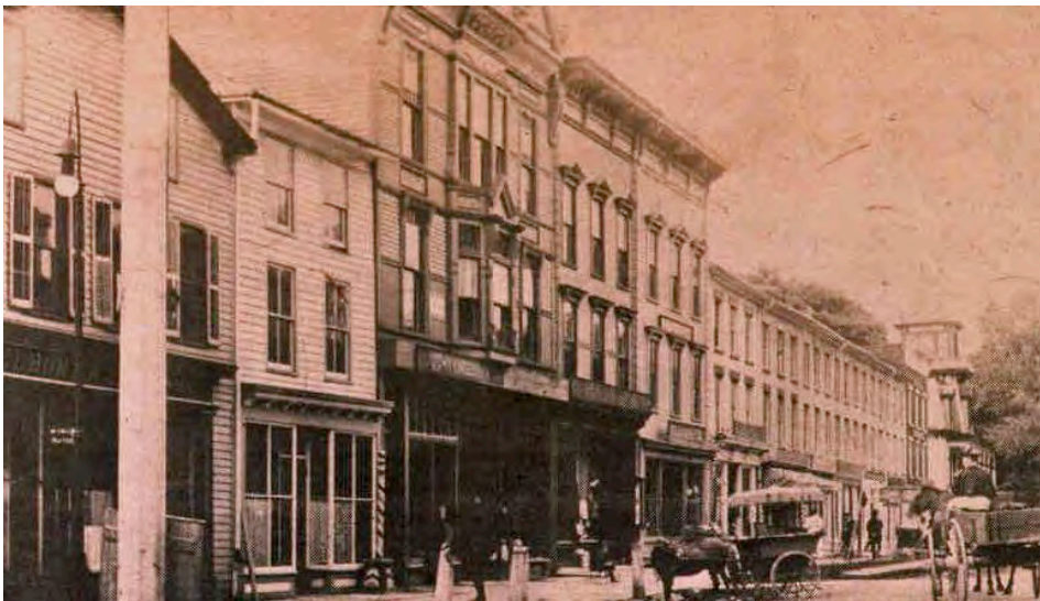
Same view after first fire showing infill buildings.