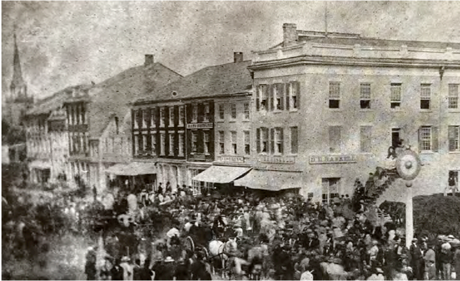
North side of Albany Street after fire showing corner building with GR details and balustrade.